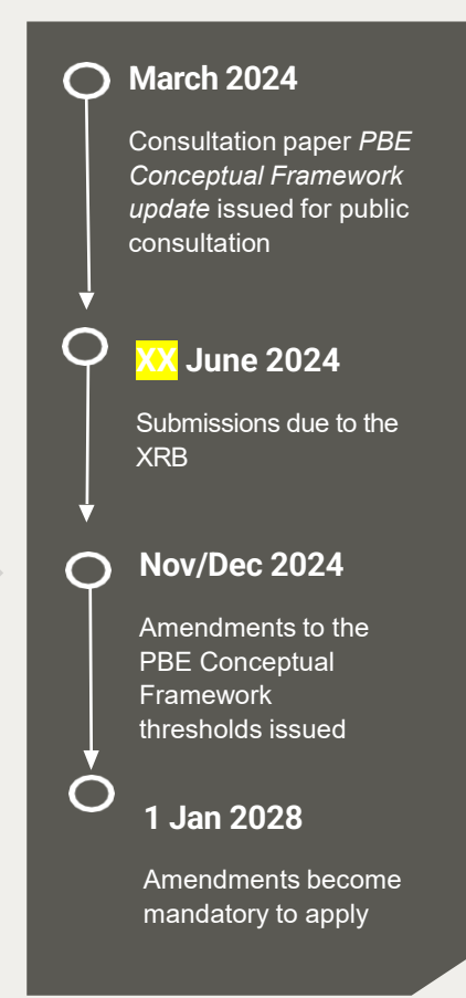
Figure 1: Timeline